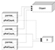
Figure 7.2. Three reference counted smart pointers pointing to the same object

The actual counter must be shared among smart pointer objects, leading to the structure depicted in Figure 7.2 . Each smart pointer holds a pointer to the reference counter ( pRefCount_ in Figure 7.2 ) in addition to the pointer to the object itself. This usually doubles the size of the smart pointer, which may or may not be an acceptable amount of overhead, depending on your needs and constraints.